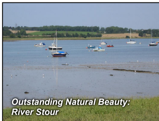
Outstanding Natural Beauty: River Stour