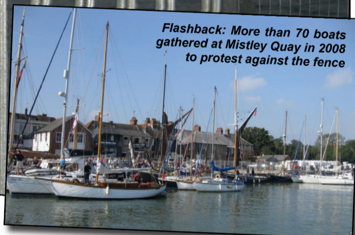
Flashback: More than 70 boats gathered at Mistley Quay in 2008 to protest against the fence