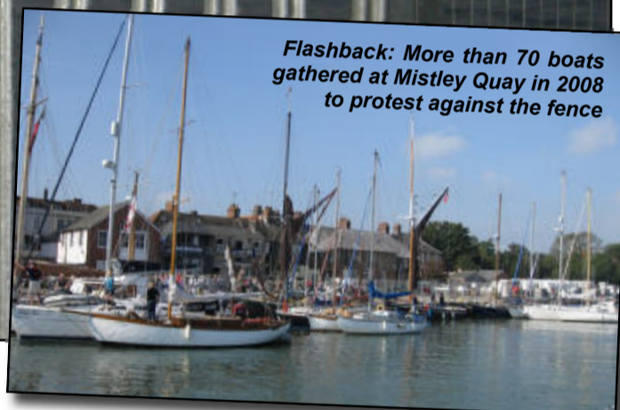
Flashback: More than 70 boats gathered at Mistley Quay in 2008 to protest against the fence