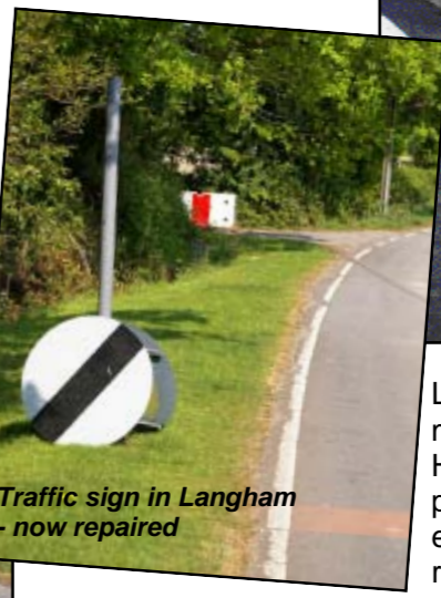
Traffic sign in Langham - now repaired

Langham has had its share of traffic matters and some notable successes. Hundreds Lane has been secured for pedestrians and horse riders only - even the 30mph limit signs have been repaired.