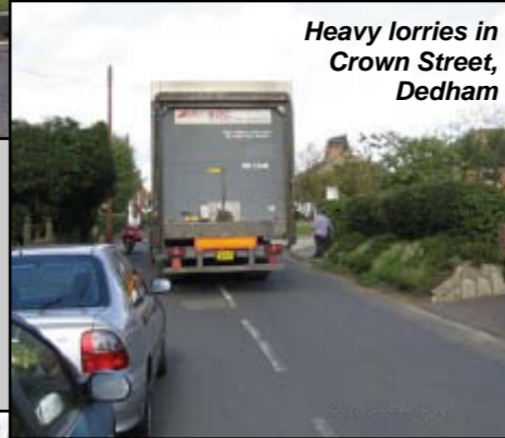
Heavy lorries in Crown Street, Dedham

Parish, Borough and County Councillors are working together to find a solution to the problem of heavy lorries using village lanes.