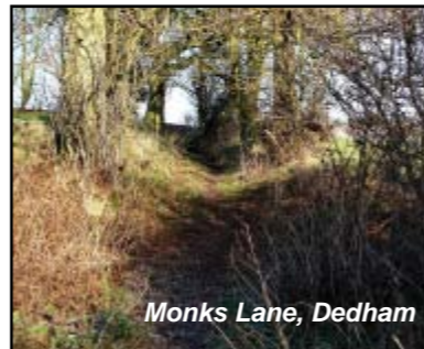
Monks Lane, Dedham