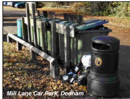
Mill Lane Car Park, Dedham

Bell shaped bottle banks are to replace the bins on the car park. "This improvement is very necessary to improve Dedham's tourist image".