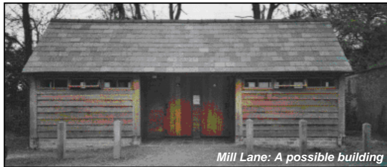
Mill Lane: A possible building

Colchester Borough Council are being encouraged to build a toilet block on the Mill Lane Car Park and to refurbish those on the playing field. Let us know what you think about these proposals by returning the survey on pages 3 and 4 of this leaflet.