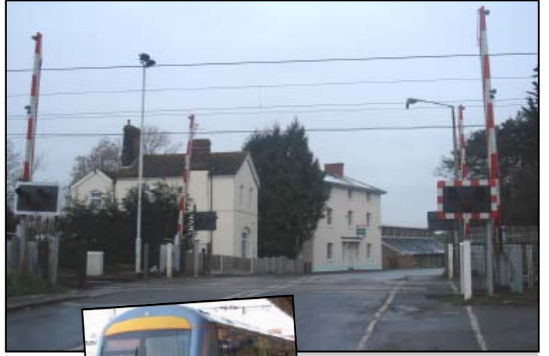
Pictured above: The level crossing in Ardleigh

The proposals, which could be in place as early as April 2007, include a night-time 'quiet period' between 2300 and 0700, the use of a lower tone of horn and a new maximum decibel level of 106. "We are not finished with this campaign yet, but at least we are making progress", added Bernard.